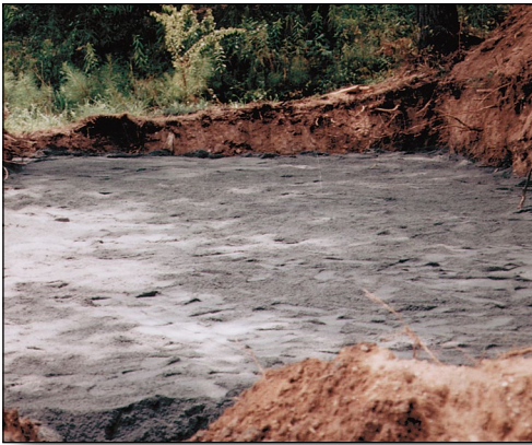
Bed prepared with washed sand