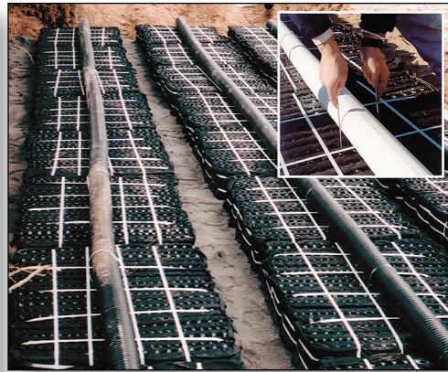
Pipes placed on modules, secured with clips