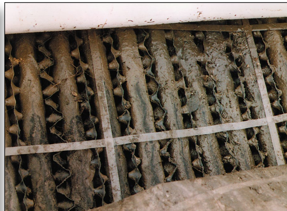
Bio-mat on fabric & surface of plastic core

125 McKee Street, East Hartford, CT 06108 800-444-1359 • 860-610-0426 • Fax: 860-610-0427 Email: info@eljen.com • Website: eljen.com