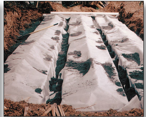
Fabric covered system is then backfilled